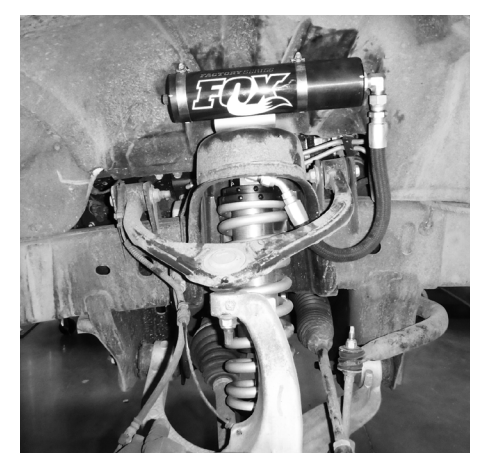
Fig. 2: Passenger side

the suspension enough to remove the stock shock. Be careful not to damage any brake lines or electrical wires.