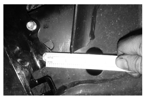
Fig. 4 - Passenger Side