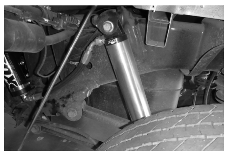
Fig. 3 - Passenger Side