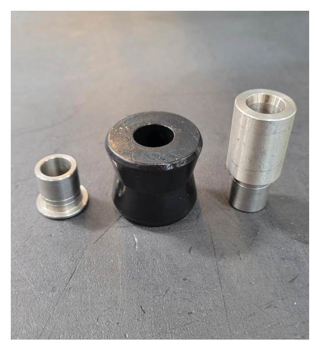
Fig. 5: Supplied Group A hardware.

4. Use the press again to install the Group A 14mm internal diameter bushing and spacers (Fig. 5, 6, 7, 8).