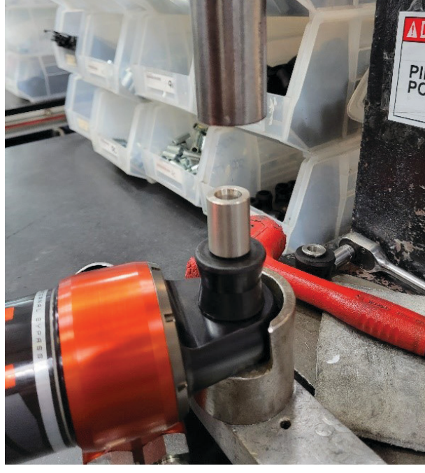
Fig. 6: Align the bushing and spacer with the eyelet.