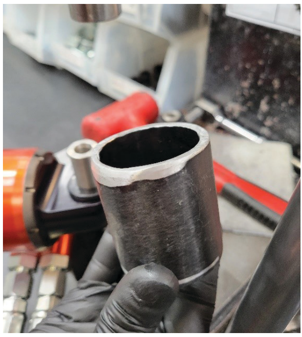
Fig. 1: Spare tubing for press.

NOTICE: The tubing needs an inner diameter between 1.5"-1 13/16" and an outer diameter less than 2 13/16".