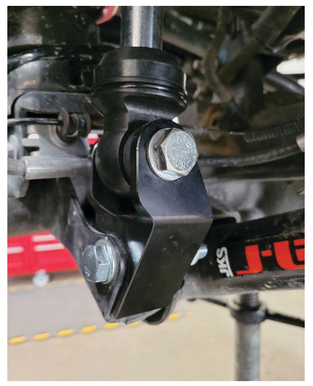
Fig. 9: Installed relocation block.