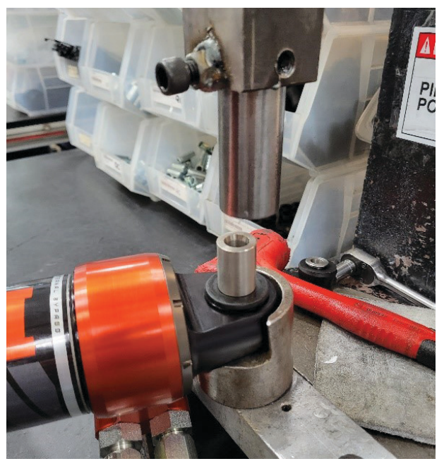
Fig. 8: Installed bushing and spacers in upper eyelet.