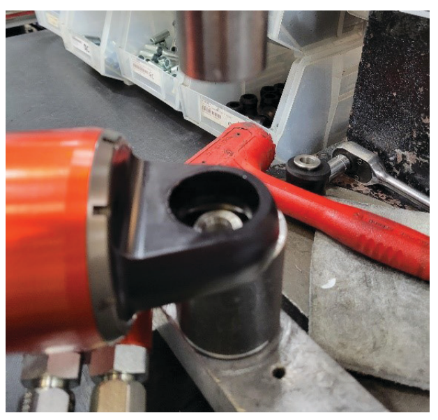
Fig. 4: Bushing and spacers are pressed out.