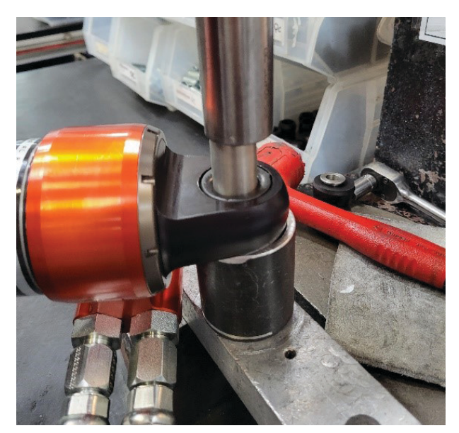
Fig. 3: Press the bushing and spacers out.

TIP: Use glass cleaner to help the bushing slide through the body cap.