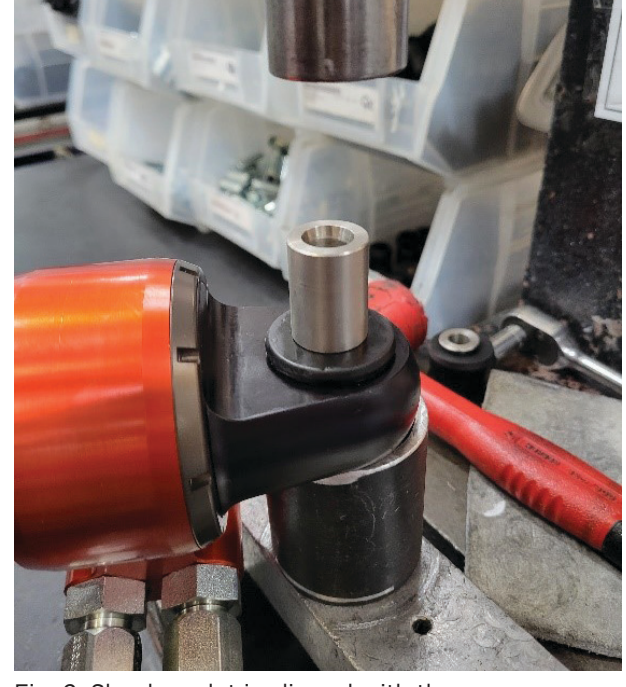
Fig. 2: Shock eyelet is aligned with the spare tubing and press.