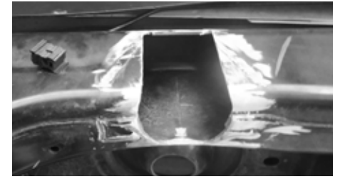
Fig. 5: Rear frame ready for chassis tube