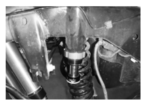
Fig. 7: Rear lock ring installed