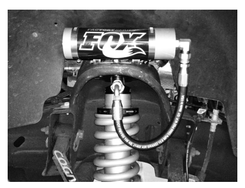
Fig. 3: Driver side

For remote reservoir models, while connecting top hat, install reservoir bracket to center outer mounting hole.