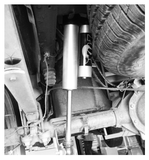
Fig. 3: Driver side