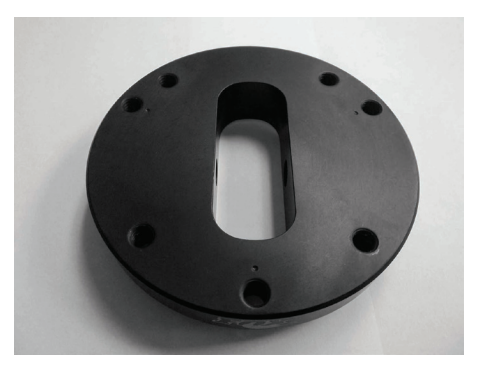
Fig. 2: Correct holes marked with a dot

* For models equipped with aluminum suspension, release the upper control arm from the spindle by loosening the nut (do not remove) to allow extra clearance.